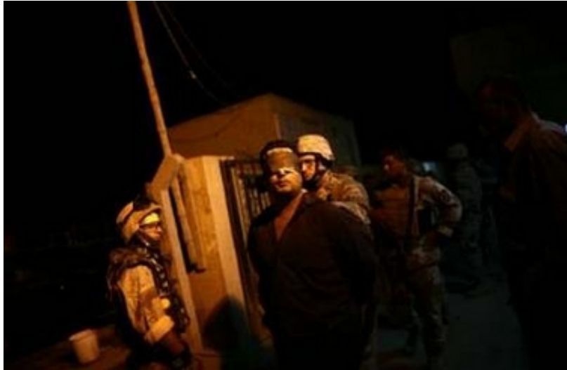
U.S. soldiers arrest Iraqi man him during a night patrol at the Zafraniya neighborhood, southeast of Baghdad September 4, 2007.