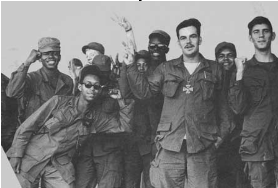
Vietnam: They Stopped An Imperial War

Not available from anybody else, anywhere