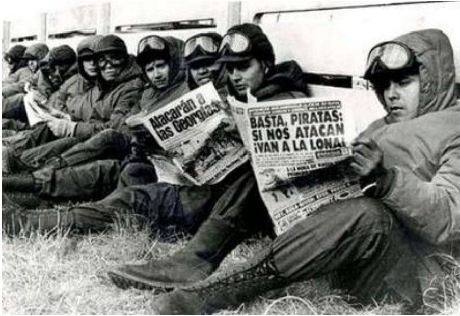
Argentine army soldiers in Port Stanley during the Falklands War (Guerra de las Malvinas) between Argentina and Britain, in an April 1982 photo.

Besides the fear and the bitter cold, Argentine war veterans say the worst thing about serving in the Falklands was the systematic abuse they suffered at the hands of their officers during the 1982 war.