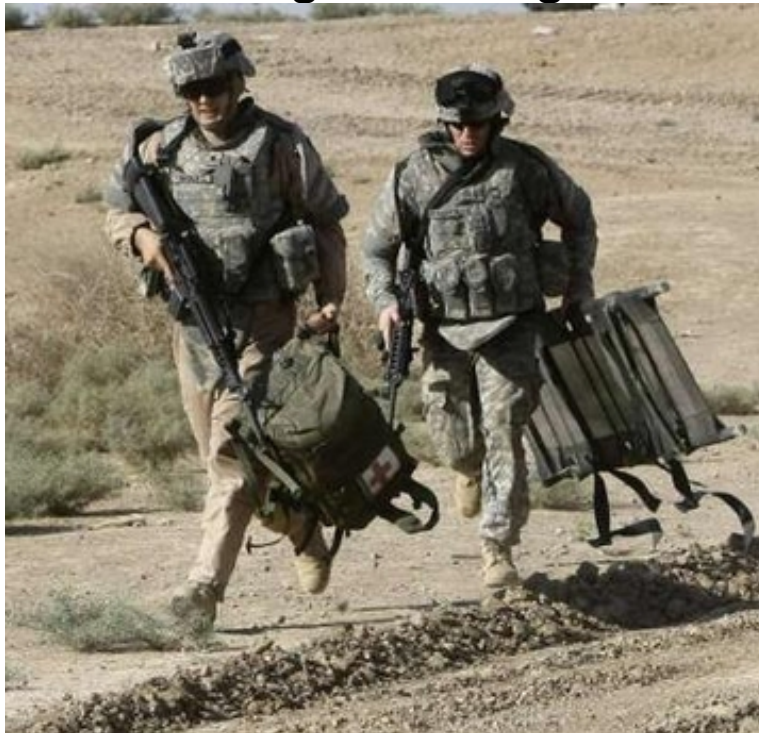
U.S. soldiers, Diyala province August 8, 2008.