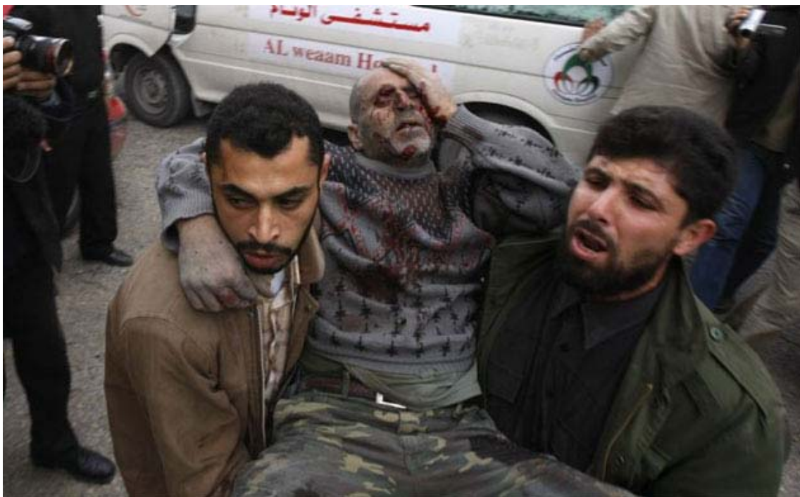
Palestinians take a wounded man to hospital. [Thanks to JM, who sent this in.]