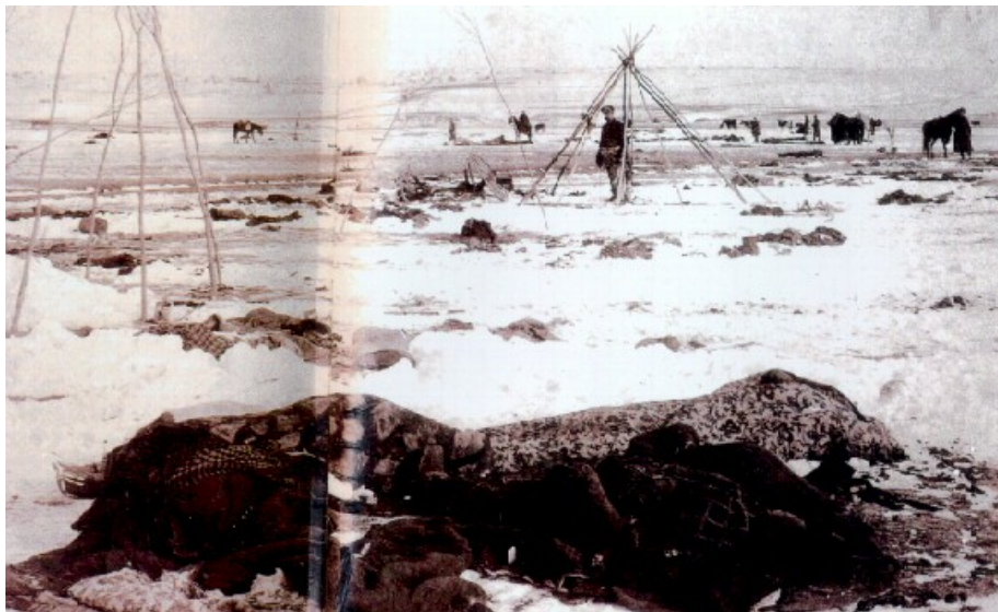
Indian Bodies on the ground at Wounded Knee