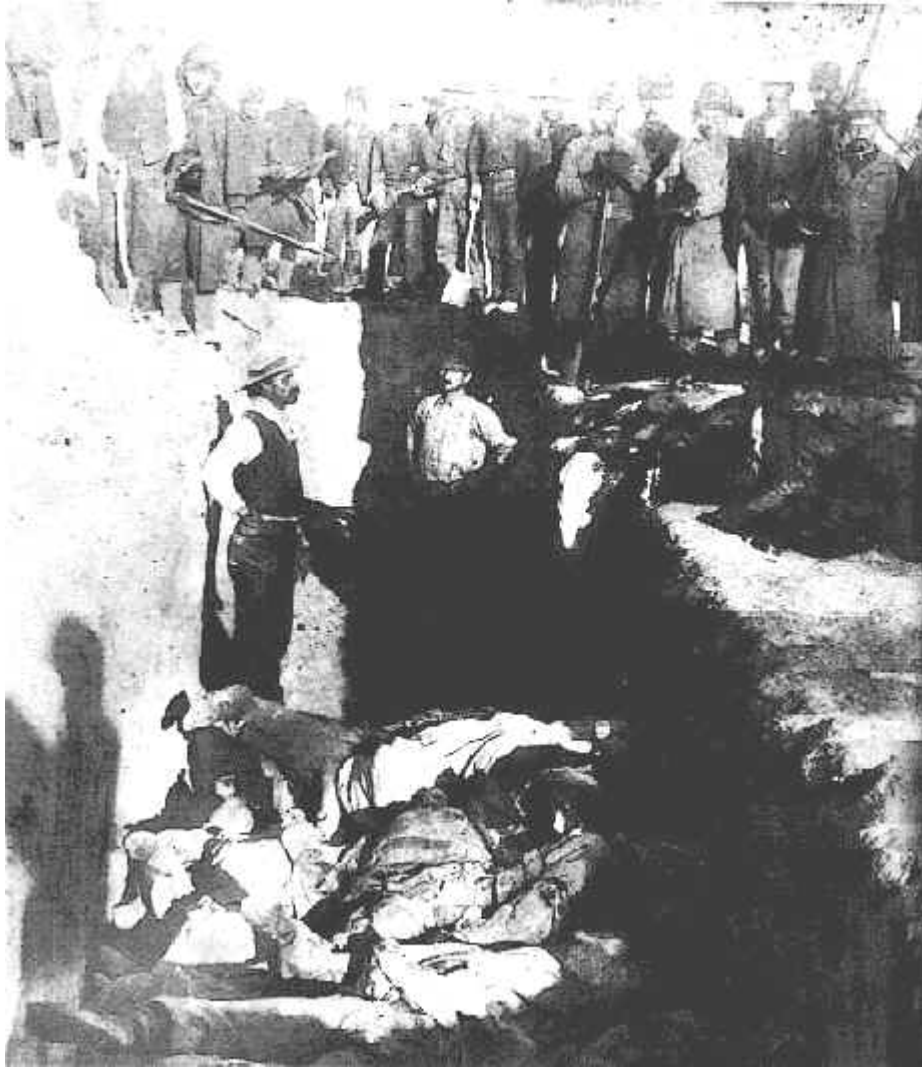
The mass grave at Wounded Knee