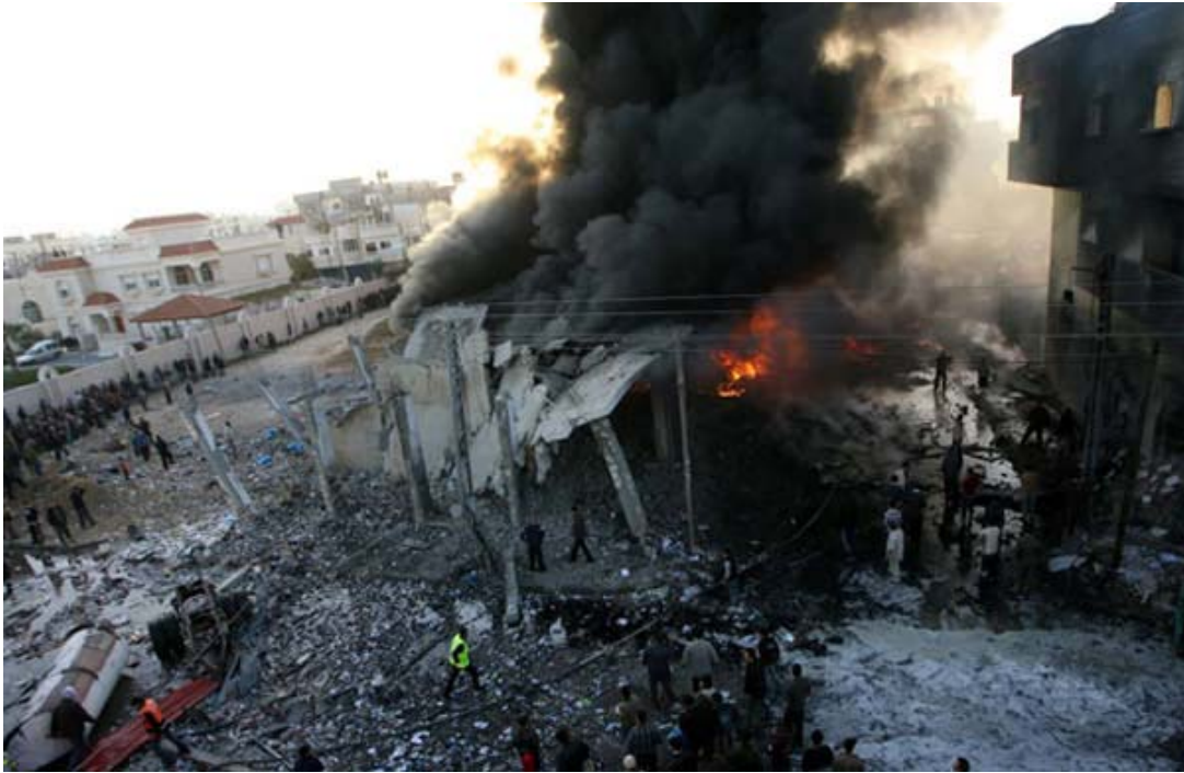
Palestinian firefighters attempt to douse flames at the site of an Israeli air strike in Rafah. [Thanks to JM, who sent this in.]