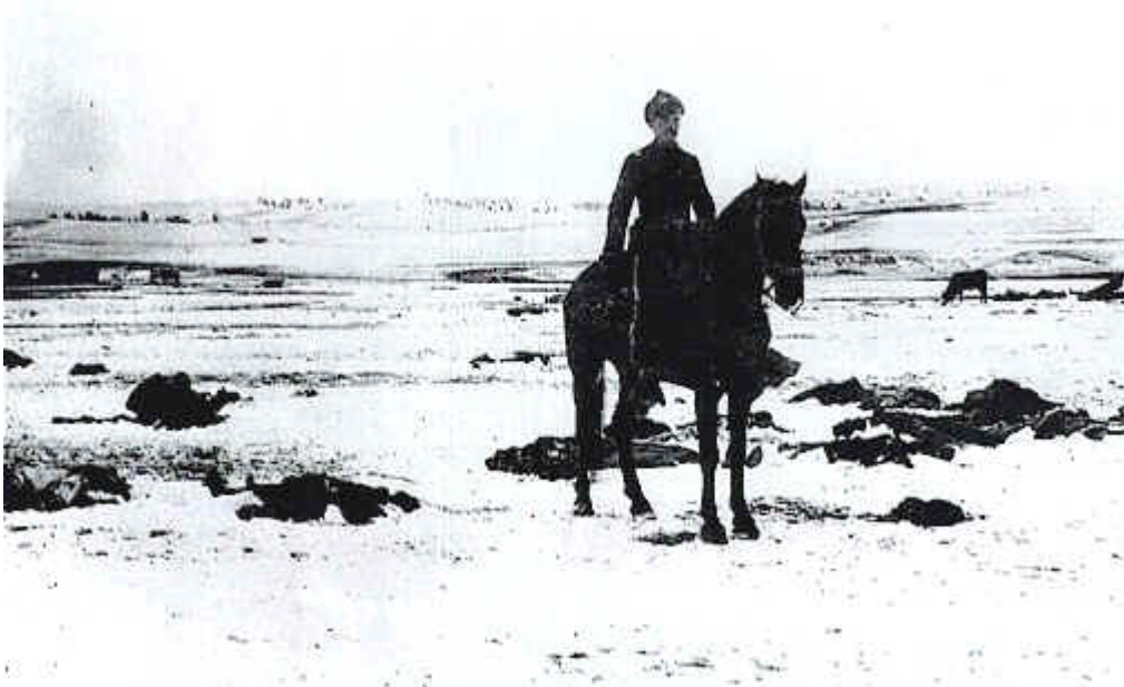
A mounted soldier rides among the dead Indians at Wounded Knee

[Via Peace History December 25-31 By Carl Bunin]