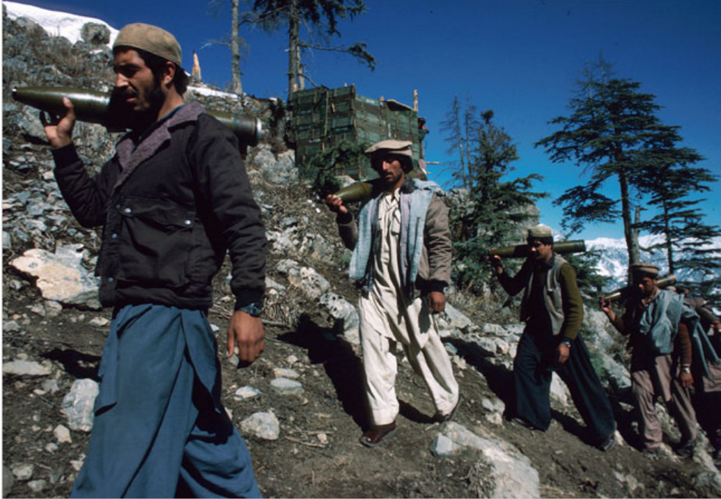
Afghan fighters carried rocket shells near the Pakistan border in February 1988 as the end of the Soviet occupation neared.

“One of our mistakes was staying, instead of leaving,” he said. “After we changed the regime, we should have handed over and said goodbye. But we didn’t. And the Americans haven’t, either.”