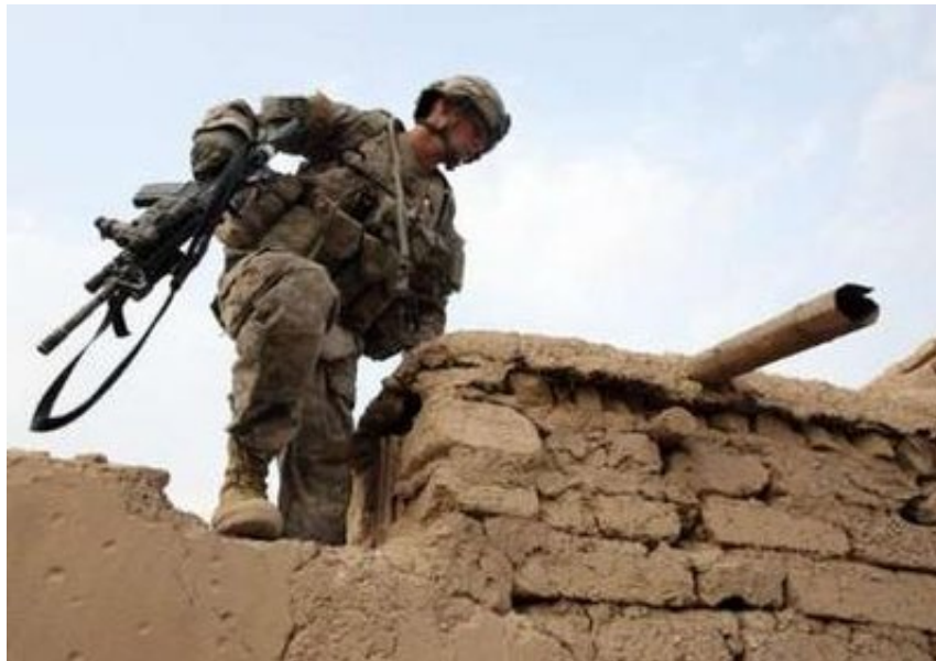
A U.S. soldier searches the compound of a house in a village near Baquba in Diyala province, northeast of Baghdad October 23, 2008.