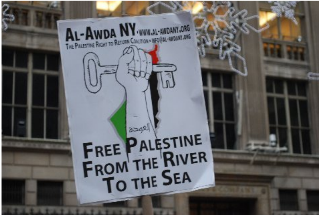
[New York City, December 30, 2008]