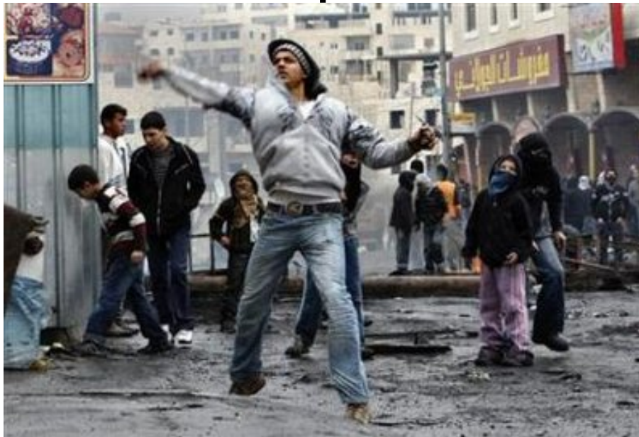
Palestinian youths throw stones at Israeli border police at Shuafat refugee camp near Zionist occupied Jerusalem, Palestine, in protest of the Israeli attacks on Gaza December 29, 2008.