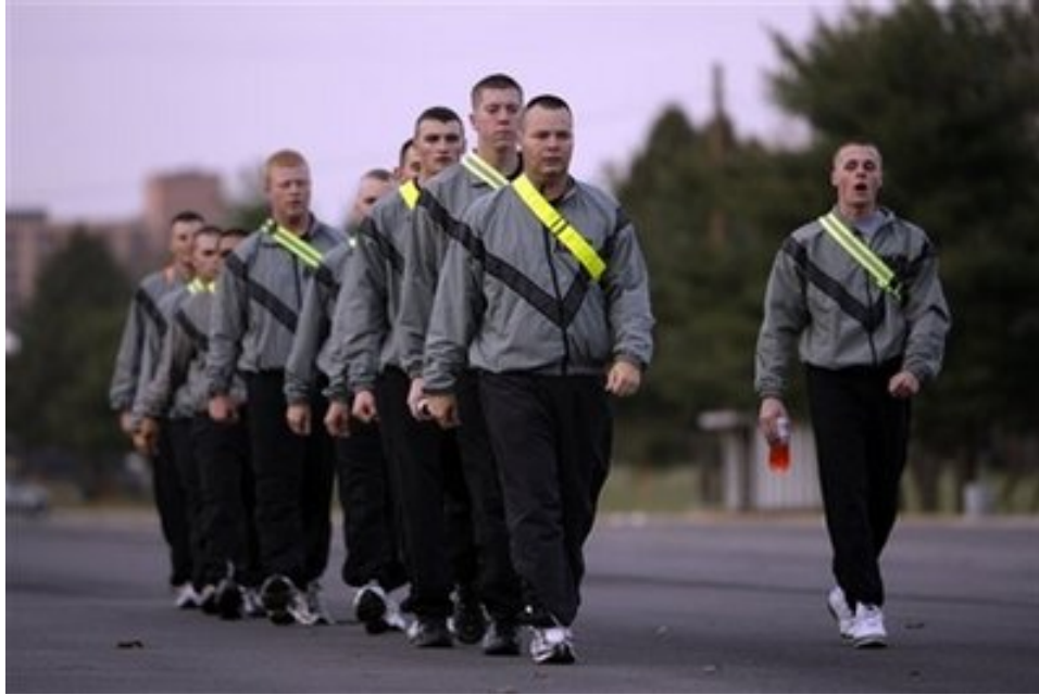
Members of the Pennsylvania Army National Guard's 56th Stryker Brigade Combat Team, exercise at Fort Dix, N.J., Thursday, Dec. 18, 2008. The 56th Stryker Brigade Combat Team, scheduled to deploy to Iraq makes up the largest contingent from the Pennsylvania Guard to deploy to a combat zone since World War II.