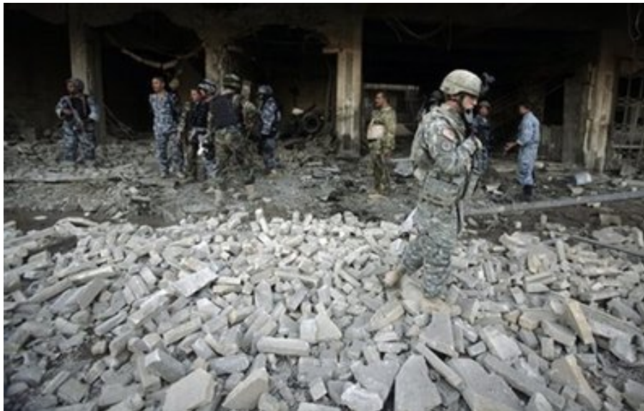
A U.S. Army, 3rd Armored Cavalry Regiment at the site of a car bombing in Mosul, Nov.1, 2008.