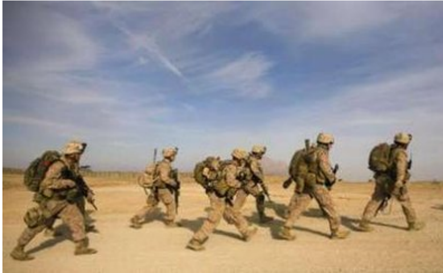
U.S. Marines from 4th Marines, walk from base Delaram in Nimroz province, southern Afghanistan January 11, 2010.