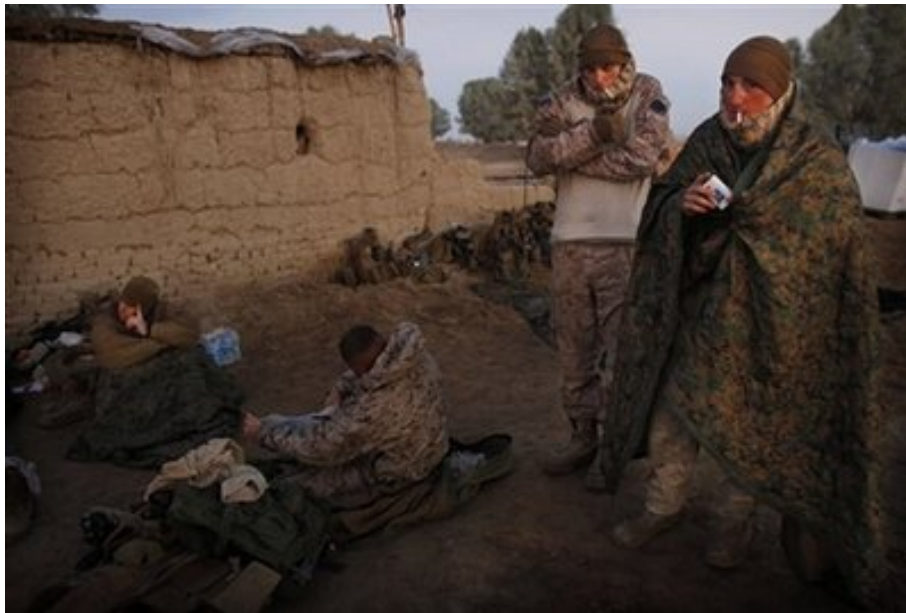
United States Marines from the 2nd Marines waking in the Garmsir district, Helmand province, Afghanistan, Dec. 18, 2009.

IF YOU DON'T LIKE THE RESISTANCE END THE OCCUPATIONS