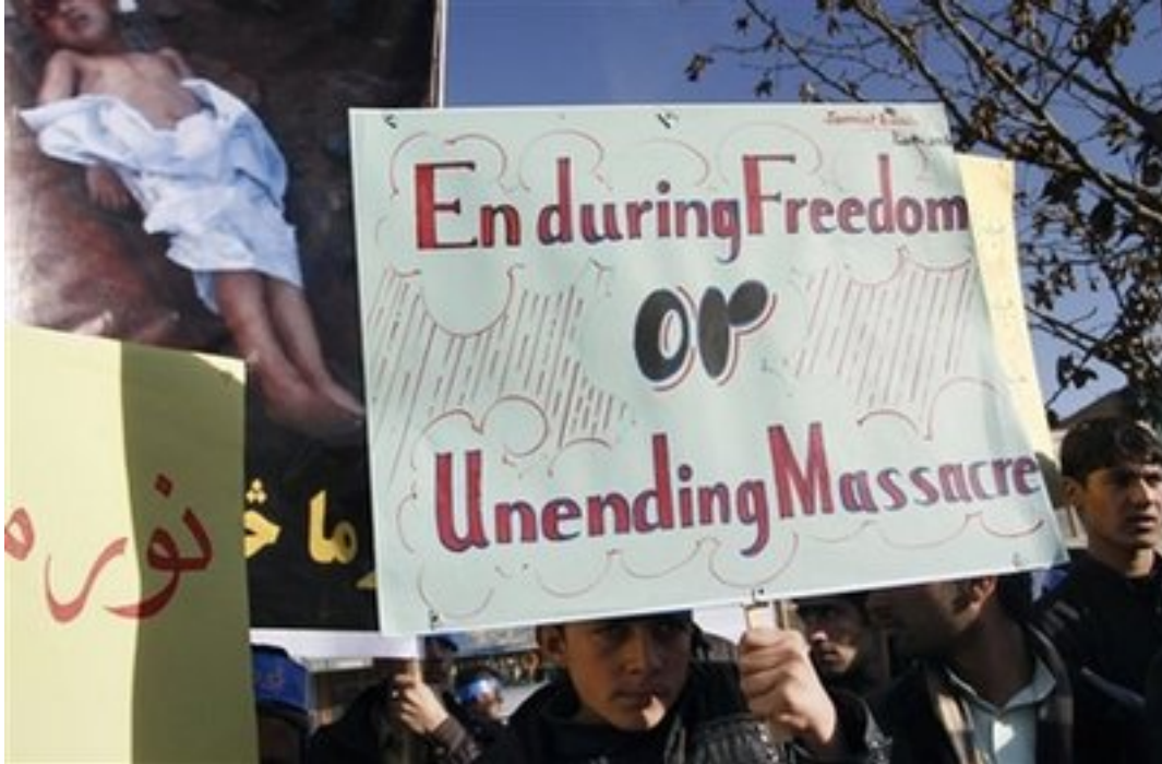
Kabul Dec. 30, 2009: Afghans rally to condemn the recent killings of school children by U.S. forces in Kunar province.

10 Reasons The U.S. Military Should (Officially) Use Marijuana: “If You Asked Any Of Us What, Out Of Everything, Was Most Effective In PTSD Treatment, We Would Tell You Marijuana”