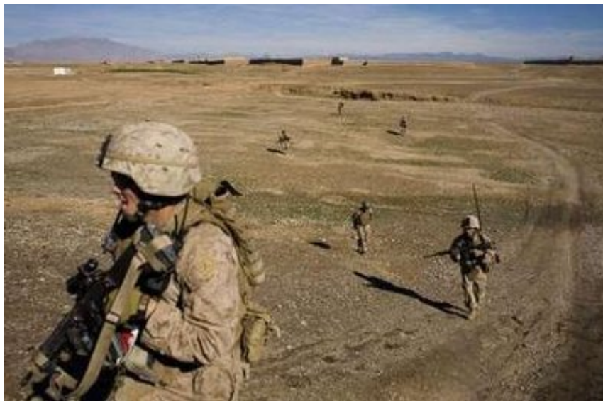
U.S. Marines from 3rd Battalion 4th Marines, patrol in the small town of Delaram in Nimroz province, southern Afghanistan January 6, 2010.