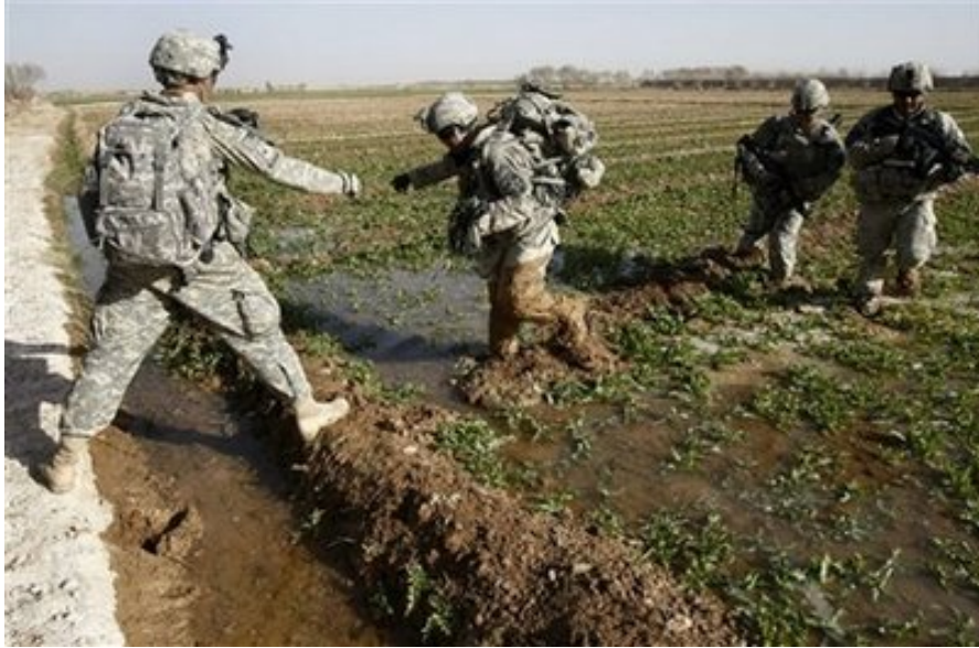
A U.S. soldier of the 1st Battalion, 17th Infantry Regiment, 5th Brigade, 2nd Infantry Division stuck in the mud in the Badula Qulp area, West of Lashkar Gah in Helmand province, southern Afghanistan, Feb. 17, 2010.