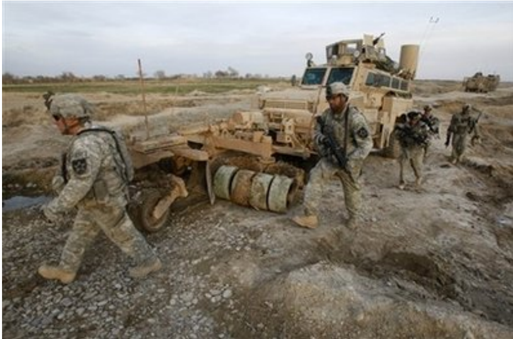
U.S. soldiers of the 2nd Infantry Division pass and walk in front of a RG-31 Mine Resistant vehicle west of Lashkar Gah in Helmand province, Afghanistan, Feb. 11, 2010.