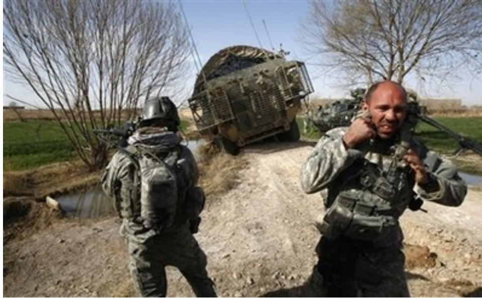
An Air Force Staff Sgt. takes off his protective vest after being covered by ants as he was laying in the field in the Badula Qulp area, west of Lashkar Gah in Helmand province, southern Afghanistan, Feb. 17, 2010.

IF YOU DON'T LIKE THE RESISTANCE END THE OCCUPATIONS