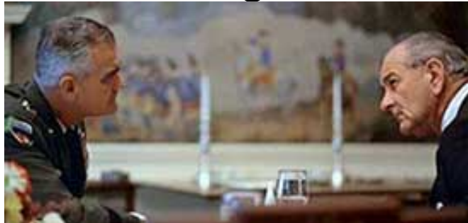
Vietnam commander Gen. William Westmoreland meeting with Pres. Lyndon Johnson