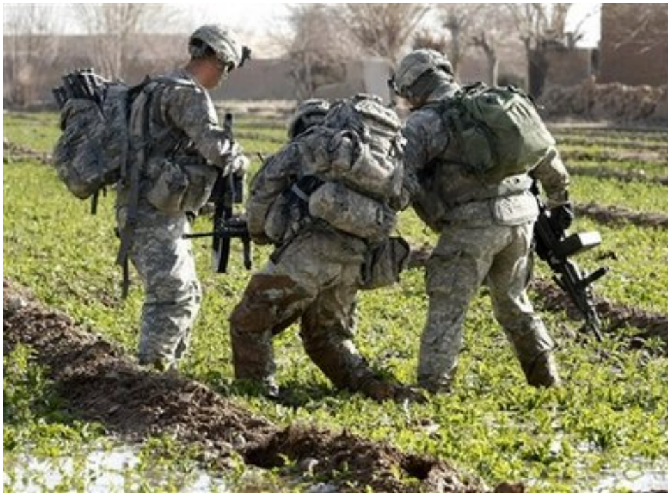
Another U.S. soldier of the 1st Battalion, 17th Infantry Regiment, 5th Brigade, 2nd Infantry Division stuck in the mud in the Badula Qulp area, west of Lashkar Gah in Helmand province, southern Afghanistan, Feb. 17, 2010.