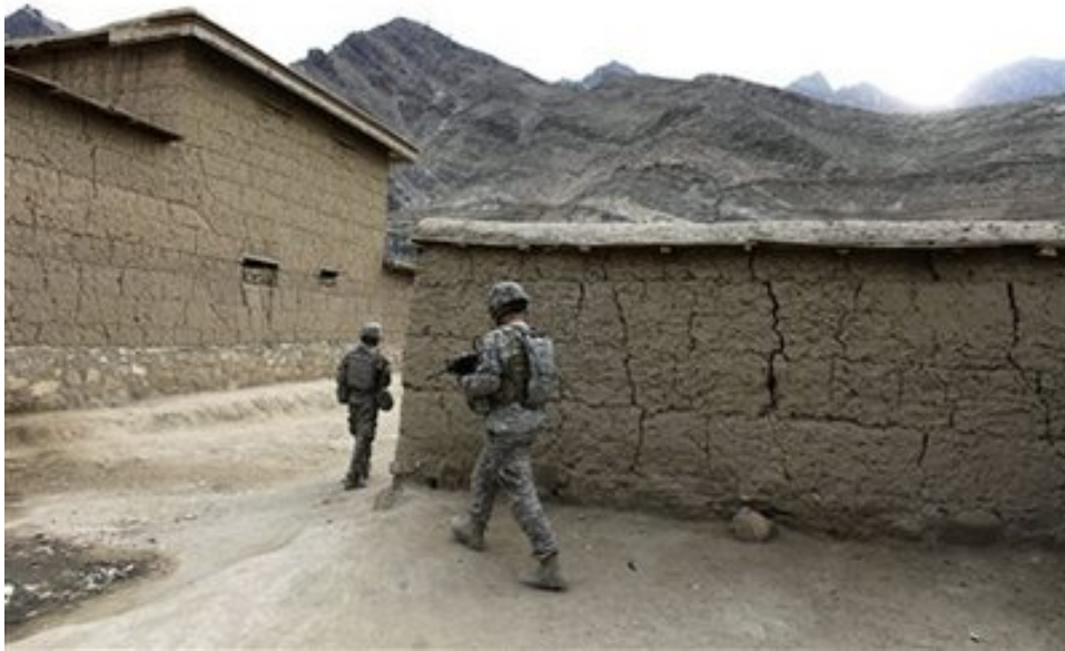
U.S. Army soldiers of the 2-12 Infantry walk on patrol in Sundray, a village in the Pech Valley, Kunar province, northeastern Afghanistan, Jan. 22, 2010.