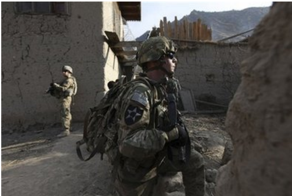
Covering his fellow soldiers, a U.S. Army soldier acting as Forward Observer watches for threats during a patrol in the Pech Valley, Kunar province, northeastern Afghanistan, Jan. 24, 2010.