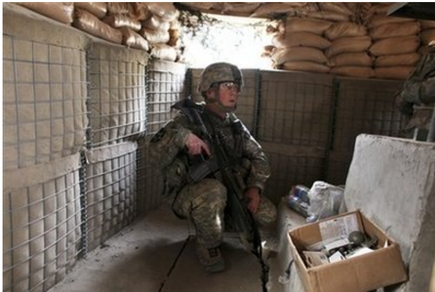
While receiving incoming mortar and machine gun fire, a U.S. Army soldier takes cover inside a guard tower, helping gunners from his unit spot Taliban positions in the hills above Combat Outpost Michigan, in the Pech Valley, northeastern Afghanistan, Jan. 20, 2010. The soldiers from Task Force Lethal at COP Michigan regularly receive small and large-arms fire from Taliban militants who operate in the hillsides overlooking the base.