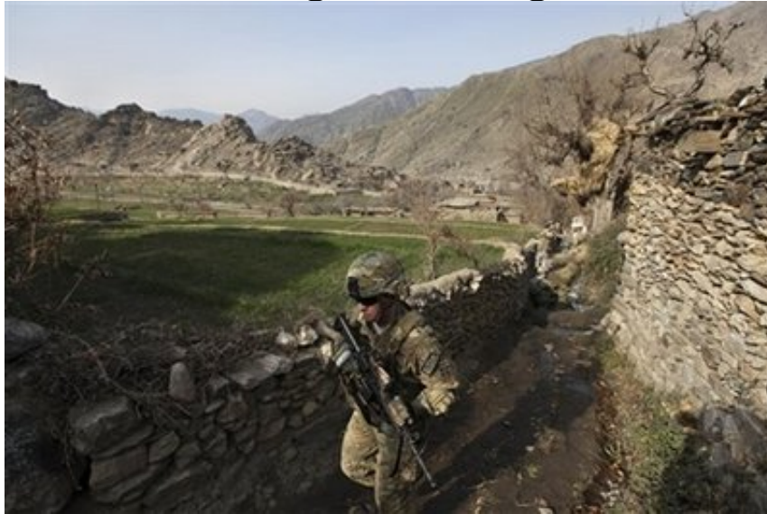
A U.S. Army soldier on patrol outside Kolack, a village in the Korengal Valley, Kunar province, northeastern Afghanistan, Jan. 19, 2010. The soldiers from Task Force Lethal regularly exchange fire with Taliban militants who operate in the hillsides of the Pech and Korengal valleys.