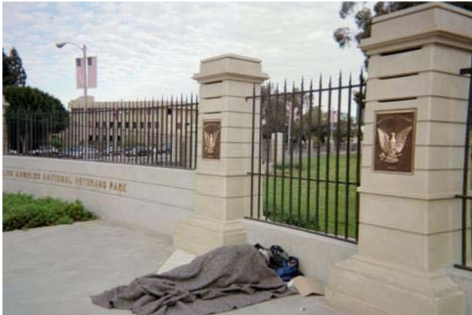
homeless individual sleeps outside the VA campus

“This Land Was Given To Us, For Use By Us, Not For Companies And Profit Of A Few”