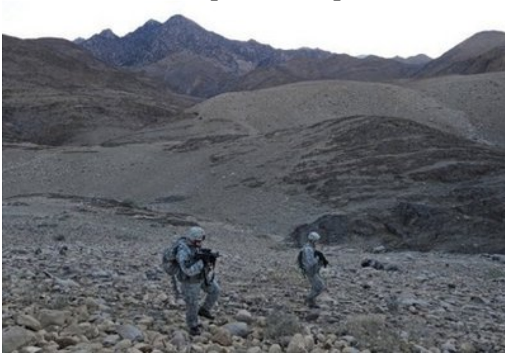
US soldiers patrol in Nuristan province in December 2009.

THERE IS ABSOLUTELY NO COMPREHENSIBLE REASON TO BE IN THIS EXTREMELY HIGH RISK LOCATION AT THIS TIME, EXCEPT THAT THE PACK OF TRAITORS THAT RUN THE GOVERNMENT IN D.C. WANT YOU THERE TO DEFEND THEIR IMPERIAL DREAMS: That is not a good enough reason.