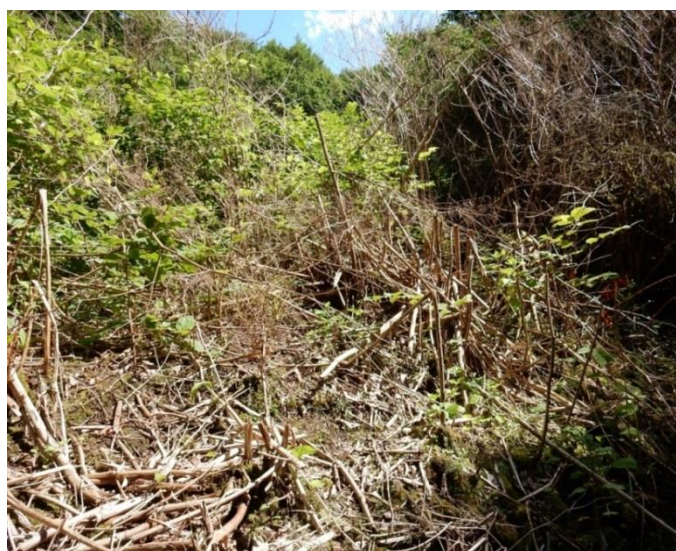
A photograph of a valley in Swansea taken in August 2015; a three-year programme of eradication of Japanese knotweed with Roundup® had been announced by the Council. The first Roundup® was sprayed in April 2015, but by August, new shoots were emerging: 1440 kg of Roundup Dakar Pro had been used by Complete Weed Control in their contract