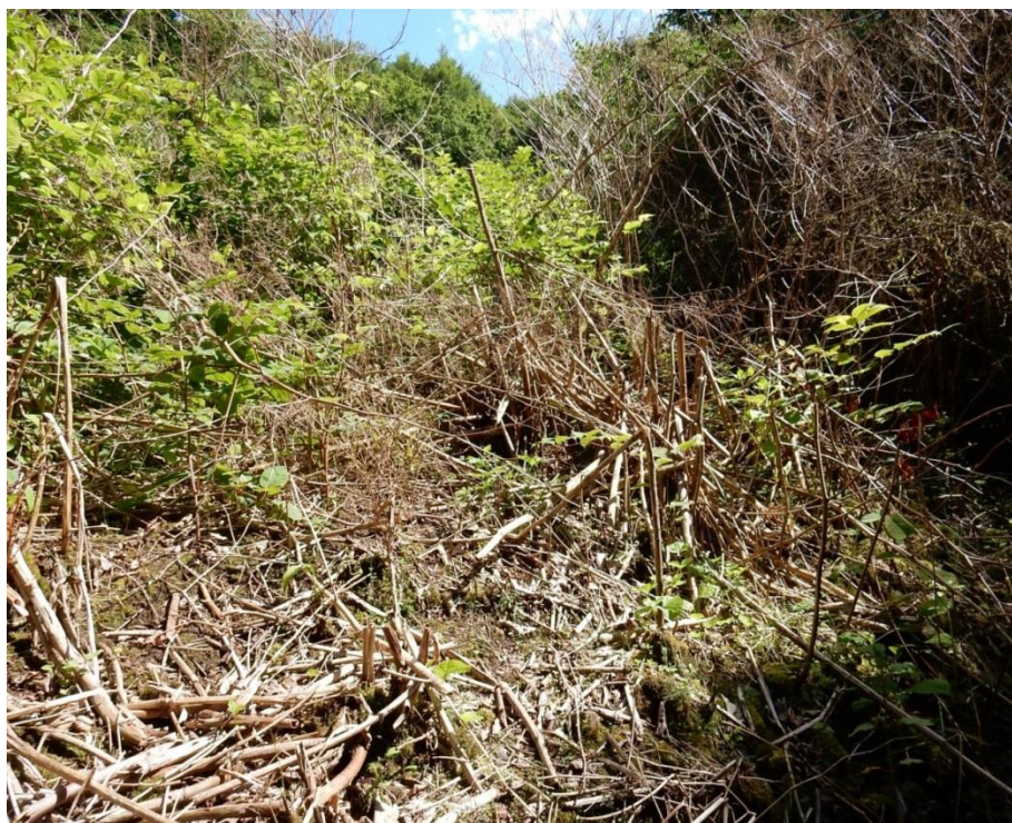
A photograph of a valley in Swansea taken in August 2015; a three-year programme of eradication of Japanese knotweed with Roundup® had been announced by the Council. The first Roundup® was sprayed in April, but by August, new shoots were emerging

Urban populations 440 are more at risk during heavy rainfall from run-off 441 than are rural populations. All this suggests that the population of Swansea has been exposed massive amounts of glyphosate over the last 20 or so years without being made aware of it.