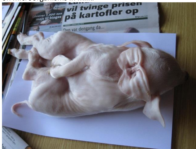
A deformed piglet; Siamese twins.

Germany over the last 10-15 years. 177 Similar effects have been shown gut bacteria in poultry 178 and on microorganisms in milk. 179