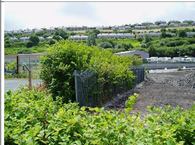
2012 Japanese knotweed invasion around a proposed building site in the Swansea Valley 10 “They were 2-3 metres in height and formed a closed canopy.”