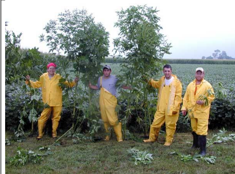
Northern Indiana. Giant Ragweed (3 m) resistant to glyphosate. Farm workers have to weed it by hand. This is one of nine different weeds that commonly occur. (By 2014, 22 have been documented)

the UK are like the Glyphosate-Resistant Super weeds which have developed in GM herbicide-tolerant crops in the US. Even the Chemical Companies have admitted to weed resistance . A press release from Dow in January 2014 urges the USDA to authorise their new GM corn and soy tolerant to a combination of 2,4-D (part of the Agent Orange defoliant) and glyphosate. 9 “ New data from November of 2013 indicate an astonishing 86 percent of corn, soybean and cotton growers in the South have herbicide-resistant or hard-to-control weeds on their farms. The number of farmers impacted by tough weeds in the Midwest has climbed as well, and now tops 61 percent. Growers need new tools now to address this challenge. ”